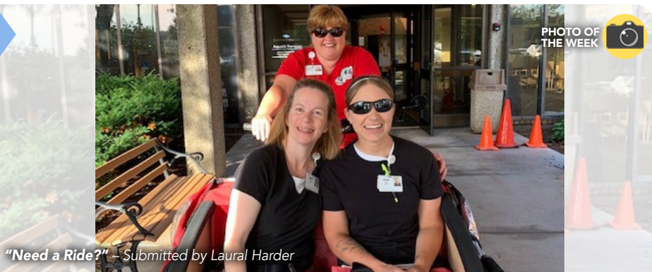
PHOTO OF THE WEEK